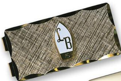
Deluxe Scalloped Money Clip, Gold Tone only, add $54.00 (C) to selected emblem pricing. Emblem not included.