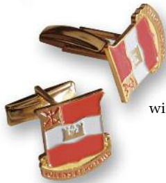
Promotional Cuff Links with Promotional (import) emblems only. Wing or fixed bullet style only. Add $5.20 (A) per pair to selected emblem pricing