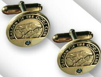
Deluxe Gold or Silver Tone Cuff Links with Made in USA emblems only. Add $9.50 per pair (A) to selected emblem pricing