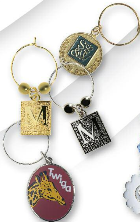
Wine Charms and Bookmarks with charms in gold or silver tone. We suggest using emblem processes from Pages 6 thru 14. Wine Charm Wire, add $0.20 (A) Bookmark, add $2.20 (A) Beads, add $0.16 (A) per bead available in red, blue, green and purple. to selected emblem pricing