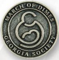
Antique Silver Finish