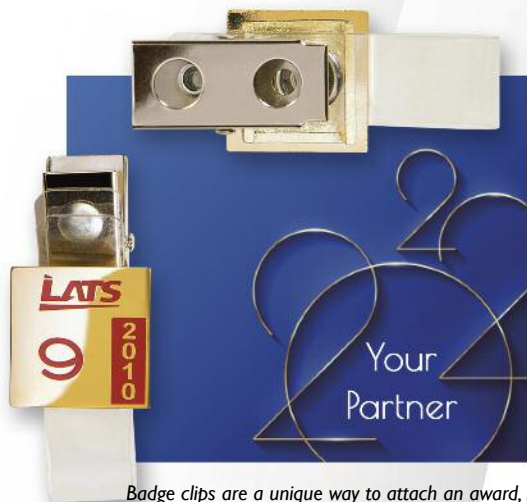
Badge clips are a unique way to attach an award, ID, or emblem to a security badge. See Backing Options for add-on pricing.