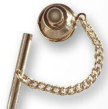
Quality Clutch Bar and Chain, add $1.60 (A) to selected emblem pricing (add suffix -01chain to selected emblem #)

Due to significant market price fluctuations, request special quote for current pricing.