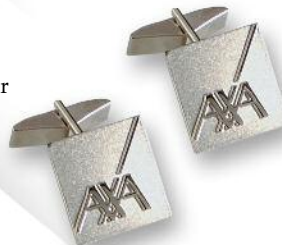
Precious Metal Cuff Links in Sterling Silver or Gold-Filled, swivel wing style, with Made in USA emblems only. Due to significant market price fluctuations, request special quote for current pricing.