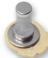
Magnetic Backing Only available with emblems on Pages 12 (gold or silver tone), Page 14 (silver tone only).

Due to significant market price fluctuations, request special quote for current pricing.