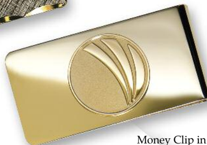
Money Clip in Gold or Silver Tone, add $5.30 (A) to selected emblem pricing