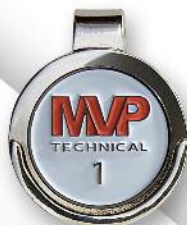
Hat Clip with Removable Ball Marker, add $5.90 (A) to selected emblem pricing