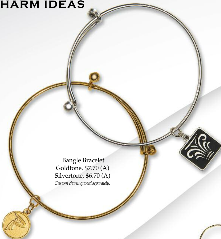
Bangle Bracelet Goldtone, $7.70 (A) Sivertone, $6.70 (A) Custom charm quoted separately.