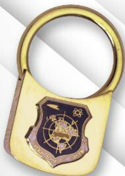
Twist Lock Key Fob, add $2.70 (C) to selected emblem pricing