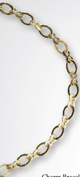
Charm Bracelet, 7" Goldtone, $4.20 (A) Sivertone, $3.90 (A)