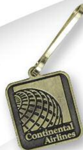
Zipper Pull, add $0.12 (A) to selected emblem pricing