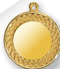
Filigree pendant add $8.00 (A) to selected emblem pricing