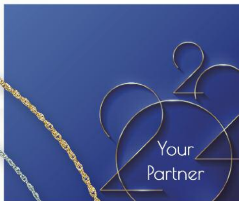
Gold-Filled Rope Link Necklace, 18", RLNCK-GF*