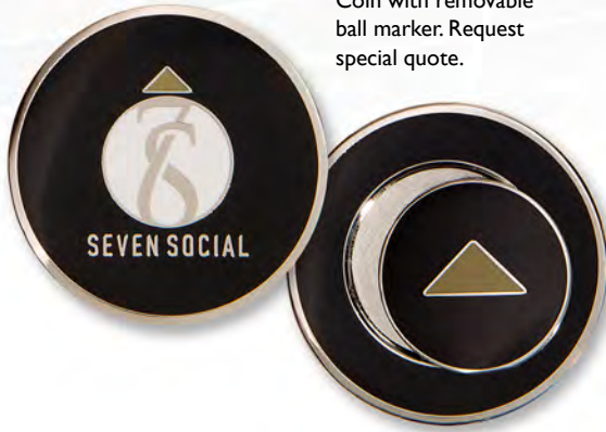
Coin with removable ball marker. Request special quote.