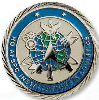
Spiral cut edge