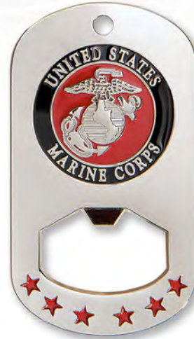
Challenge coin bottle opener. Request special quote.