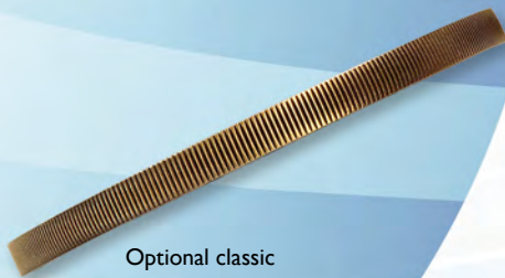
Optional classic reeded edge Request special quote