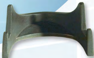
Coin stand, add $2.20 (C).