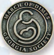
Antique Silver Finish